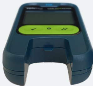
Removable RJ45 remote port