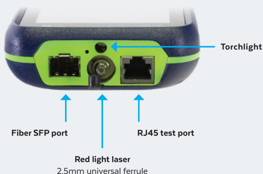
LinkXpert M3 ports