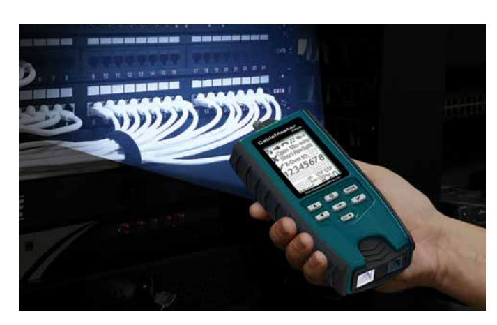
Easy to read, backlit LCD screen with large icons, glow-in-the-dark keypad and built-in LED flashlight for use in dark areas