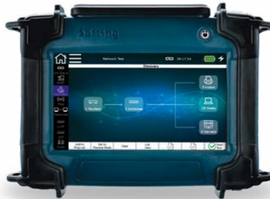
To perform a network discovery test, the main device must be connected to a switch.