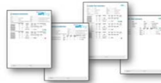
The NetXpert XG generates detailed or summarized result-reports in PDF- or CSV-format with your company logo. The reports can be exported from your device via a USB stick.

The NetXpert offers full flexibility regardless of whether you are measuring fiber or copper cabling. Using its available SFP/SFP+ ports, various active fiber tests such as protocol detection (CDP/LLDP), network ping test and network discovery can be performed. In the area of passive tests, qualification of fiber optic cabling will be possible by connecting one main unit at each end.