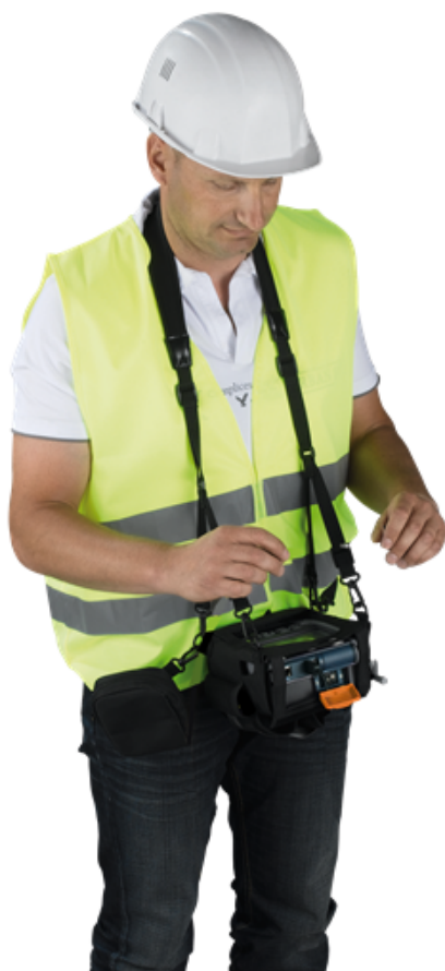
Hands-free FiberXpert strap